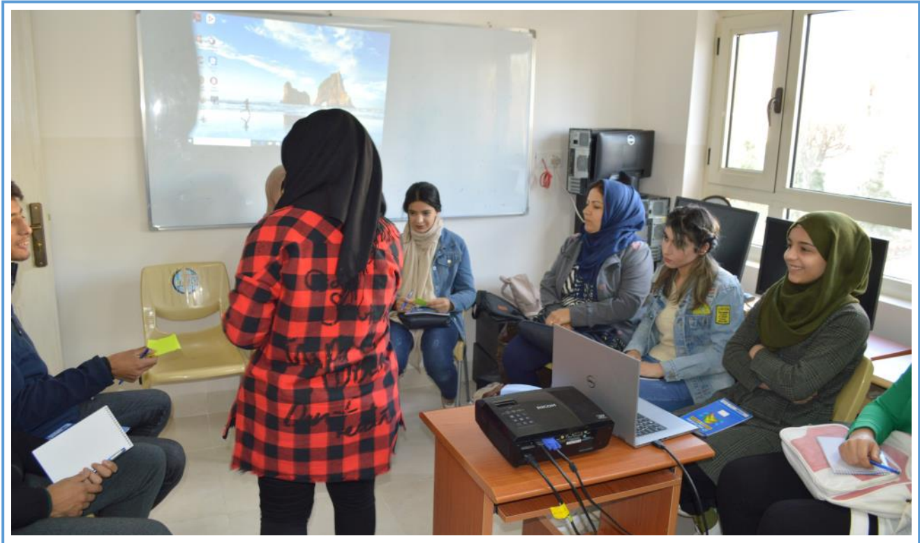
Computer training for adults, Bazyan Community Center

REACH Community Centers in Sulaimaniya continue to provide non-formal educational activities for host community, Syrian refugees and IDP children and adults.