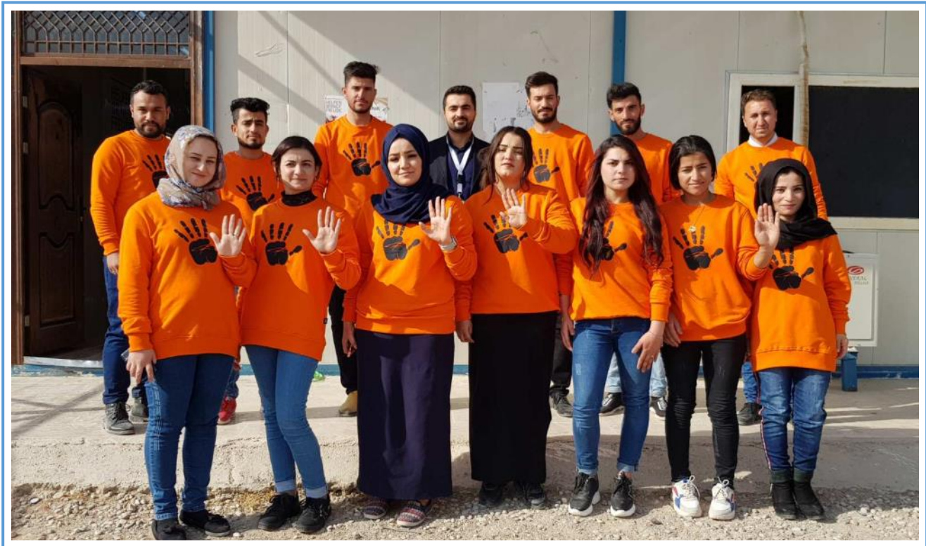
Celebration of end of violence against women day, Mamrashan camp, Duhok

REACH organized trainings for children and adults in Mosul , regarding Child protection and IED . 154 children and 406 adults took part in the trainings.